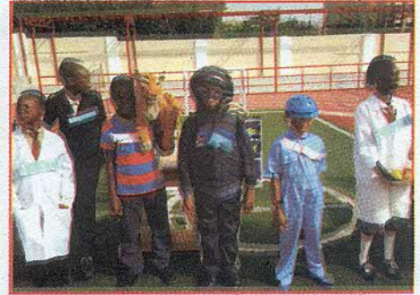
What it takes to be a scientist