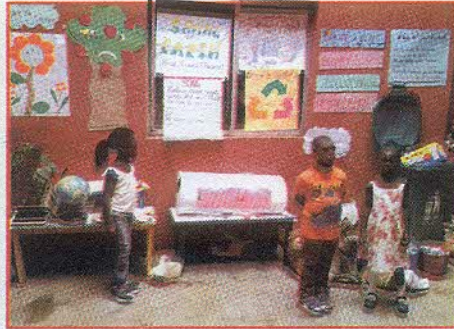
Saving the Earth