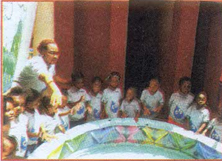
Water is Life