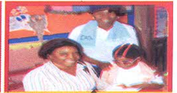
Parents checking their children's work