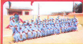
Grade one student "surgeons", teach us the 6 best doctors