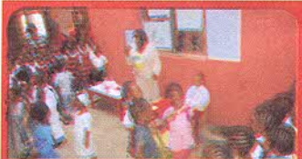
At the Dentists