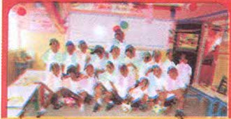
Exercise is fun.