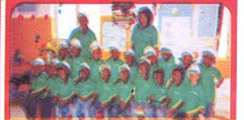
Be Snackwise—Nursery One