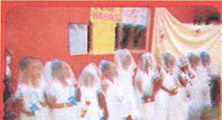
The Ten Virgins