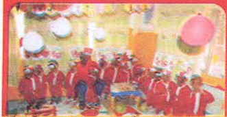
Eat your red colours. Tomatoes, strawberries, Apples, water melon, red cashew and peppers