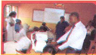
Children got their eyes and teeth checked