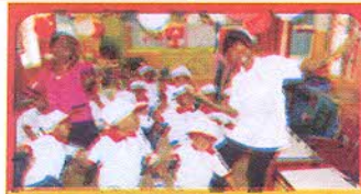
Have fun but Play Safe—Nursery Two

cooperating with us, as the pupils were submitted to long weekends and hours of drills and assignments. We congratulate you all, as our pupils clinch successful admissions into higher institutions at home and abroad. Of course we do not make light to thank God for our wonderful team of able dedicated and devoted teaching and non-teaching staff. Once again parents, thank you for believing in us.