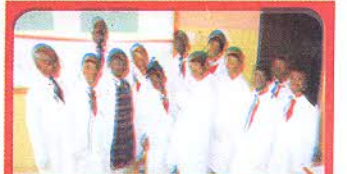
Grade 3 "Medical Students"