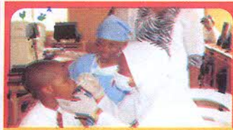
A real doctor checks us out, while the "student" doctor looks on.