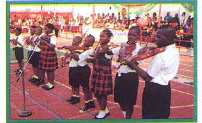
School Instrumentalists Display