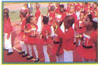
This little Light of Mine, I will let it Shine. (Nur. 1)