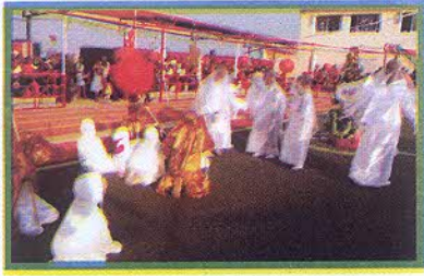
The Angels of God appeared to the Shepherds while watching their flock