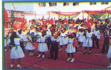
Deck the Halls with boughs of Hoolly (Prep Grade)