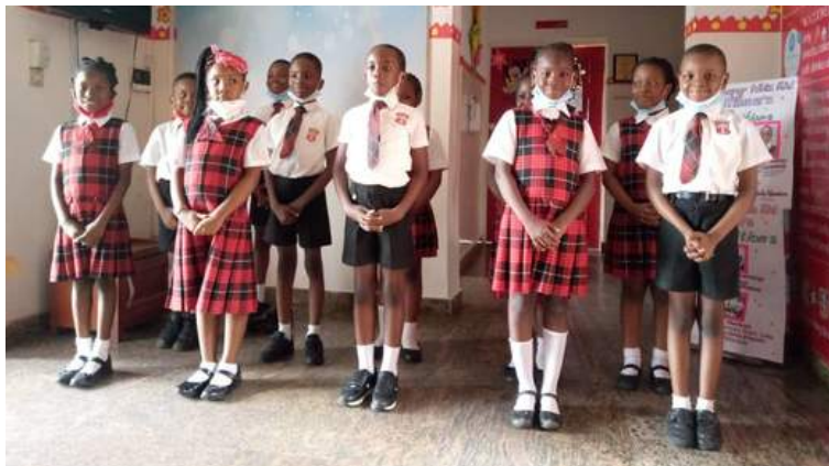
It's all about Safety with Grade 2 Pupils.