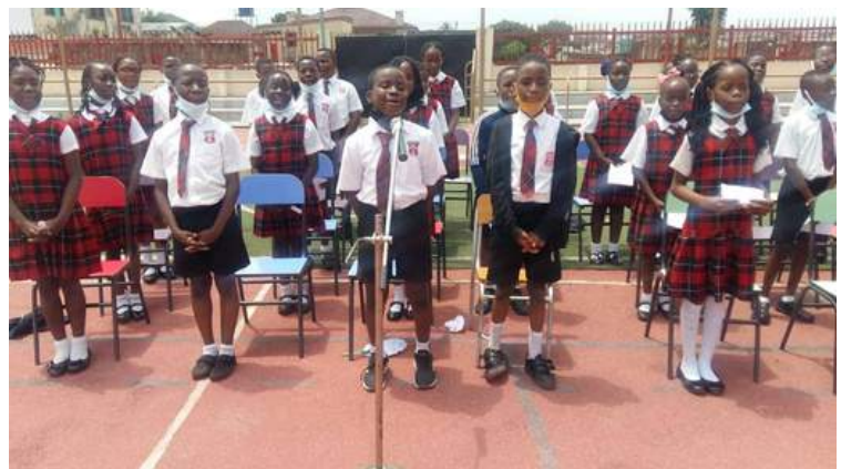
Choir rendition for the Valedictory